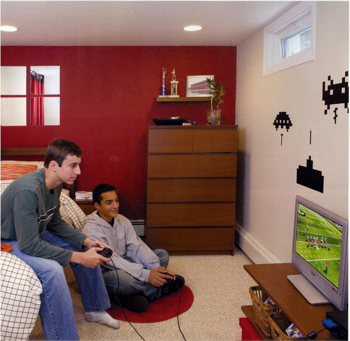
STYLING: BETH WICKWIRE